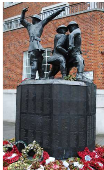
National Fire Fighter Memorial.