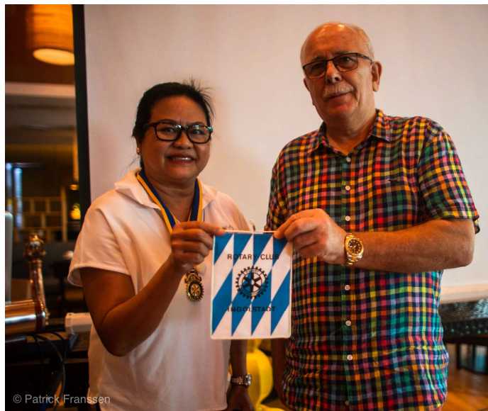
Presentation of RC Ingolstadt Germany Banner.