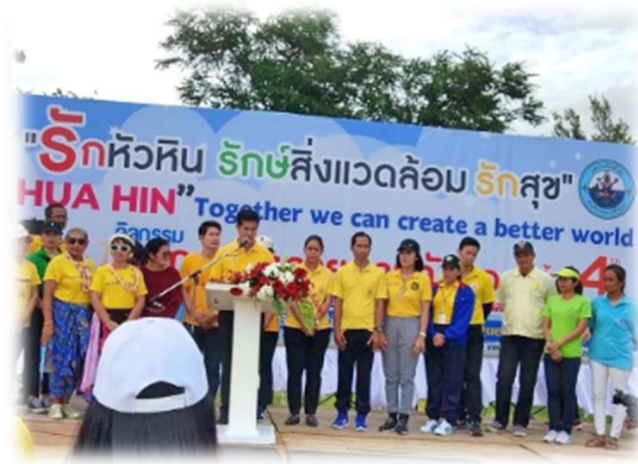
Love Hua Hin Campaign.