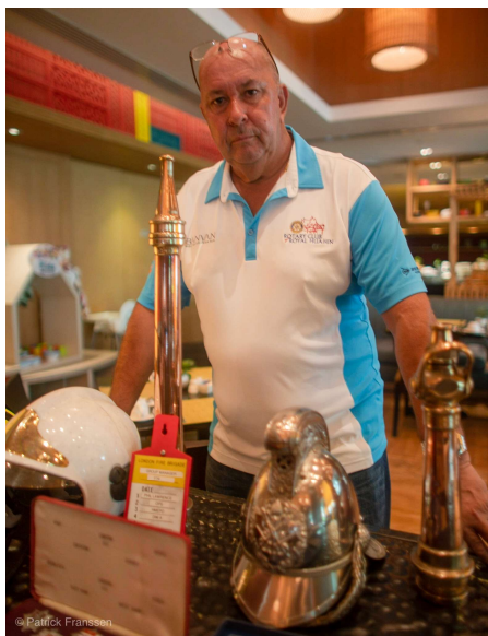
Fire Fighting Memorabilia